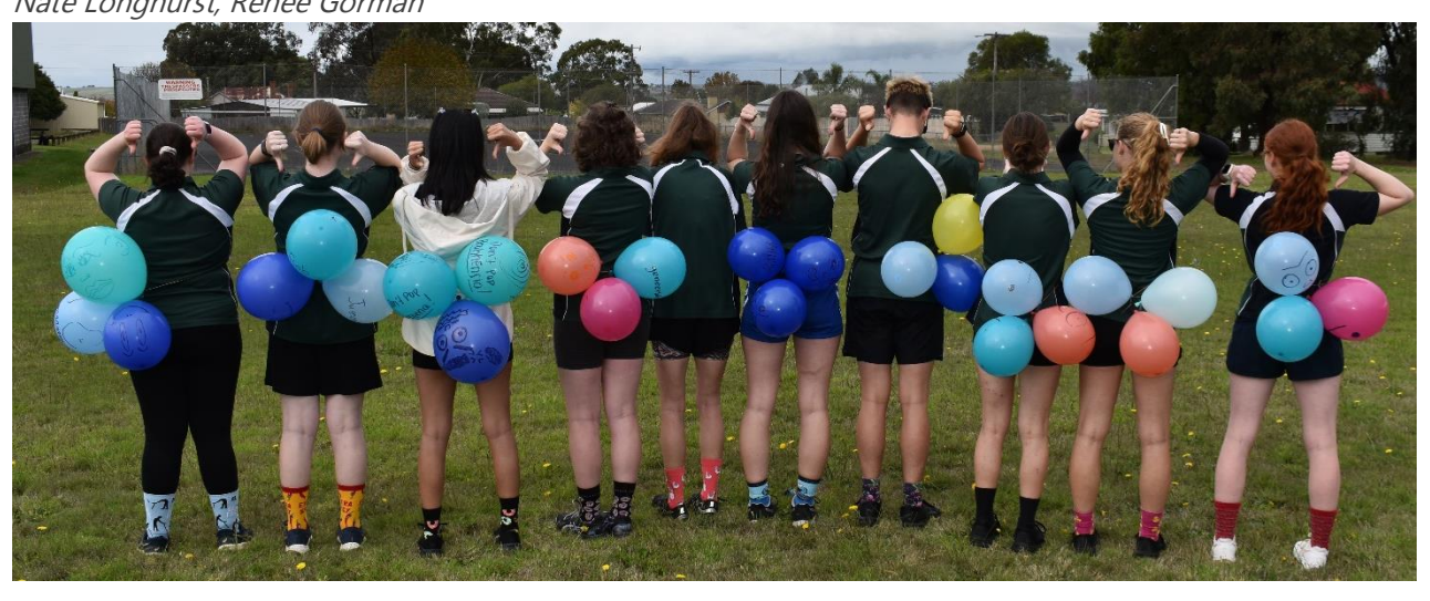
Year 12's adding fun & colour to the cross country.