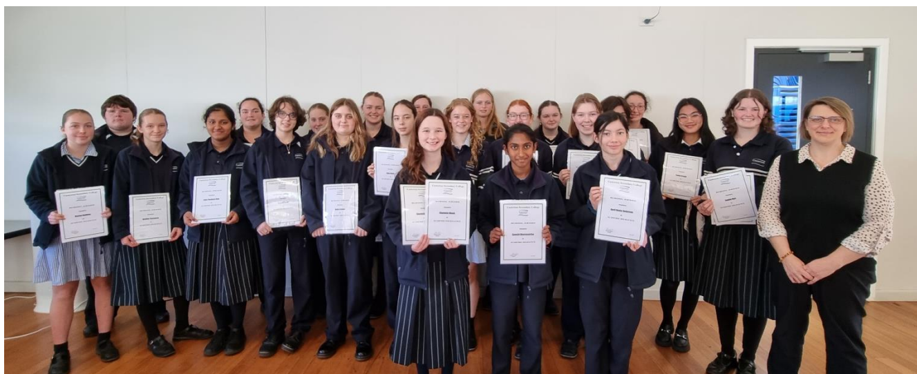
DILIGENCE AWARD RECIPIENTS