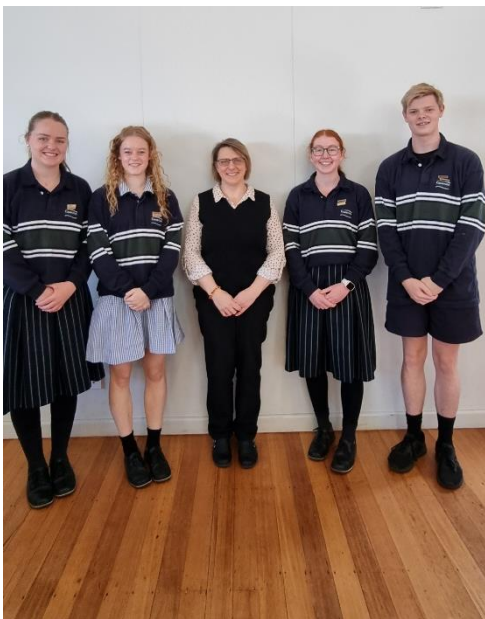
STUDENT LEADERSHIP TEAM