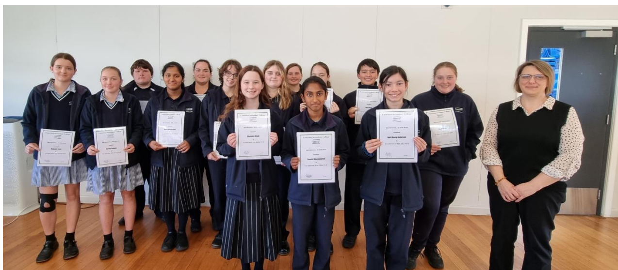
EXCELLENCE AWARD RECIPIENTS