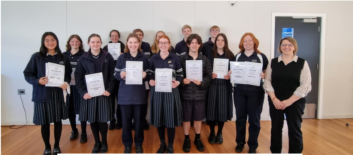
Year 11 & 12 SUBJECT AWARDS RECIPIENTS