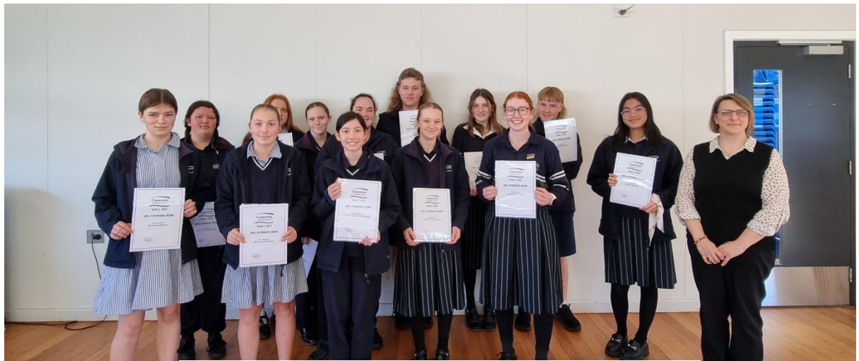
100% ATTENDANCE AWARD RECIPIENTS