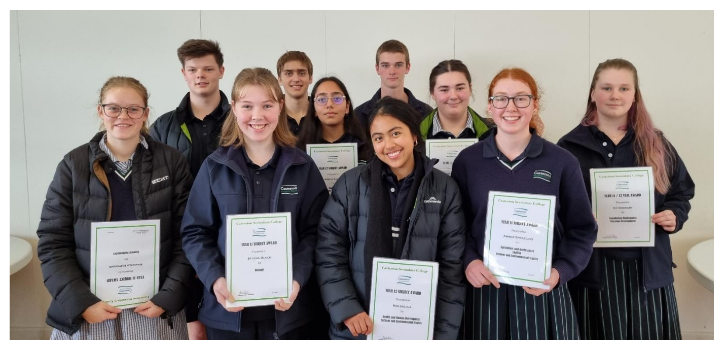
Subject Award recipients