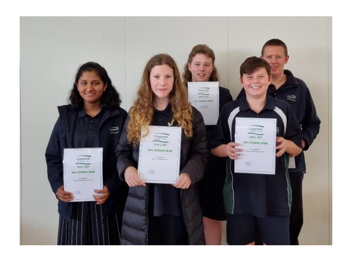
100% Attendance recipients facebook.com/castertonsecondarycollege