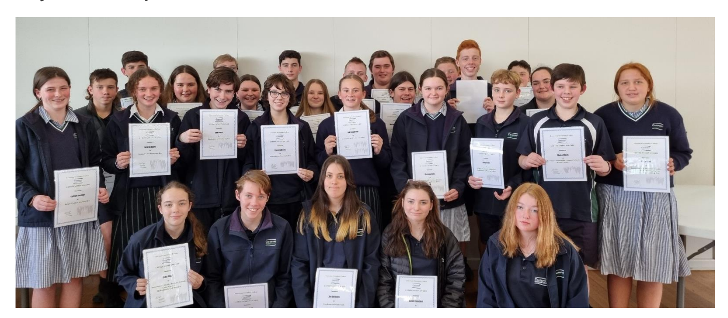
Citizenship Award recipients