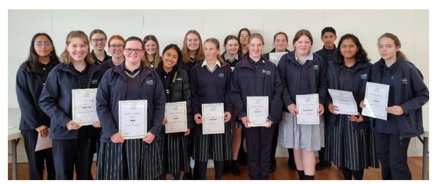
Diligence Award recipients